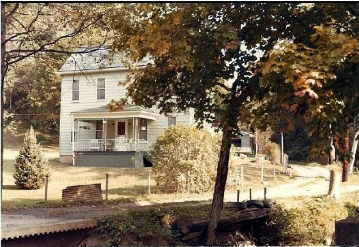
The former Burke & Bell Homes are gone.